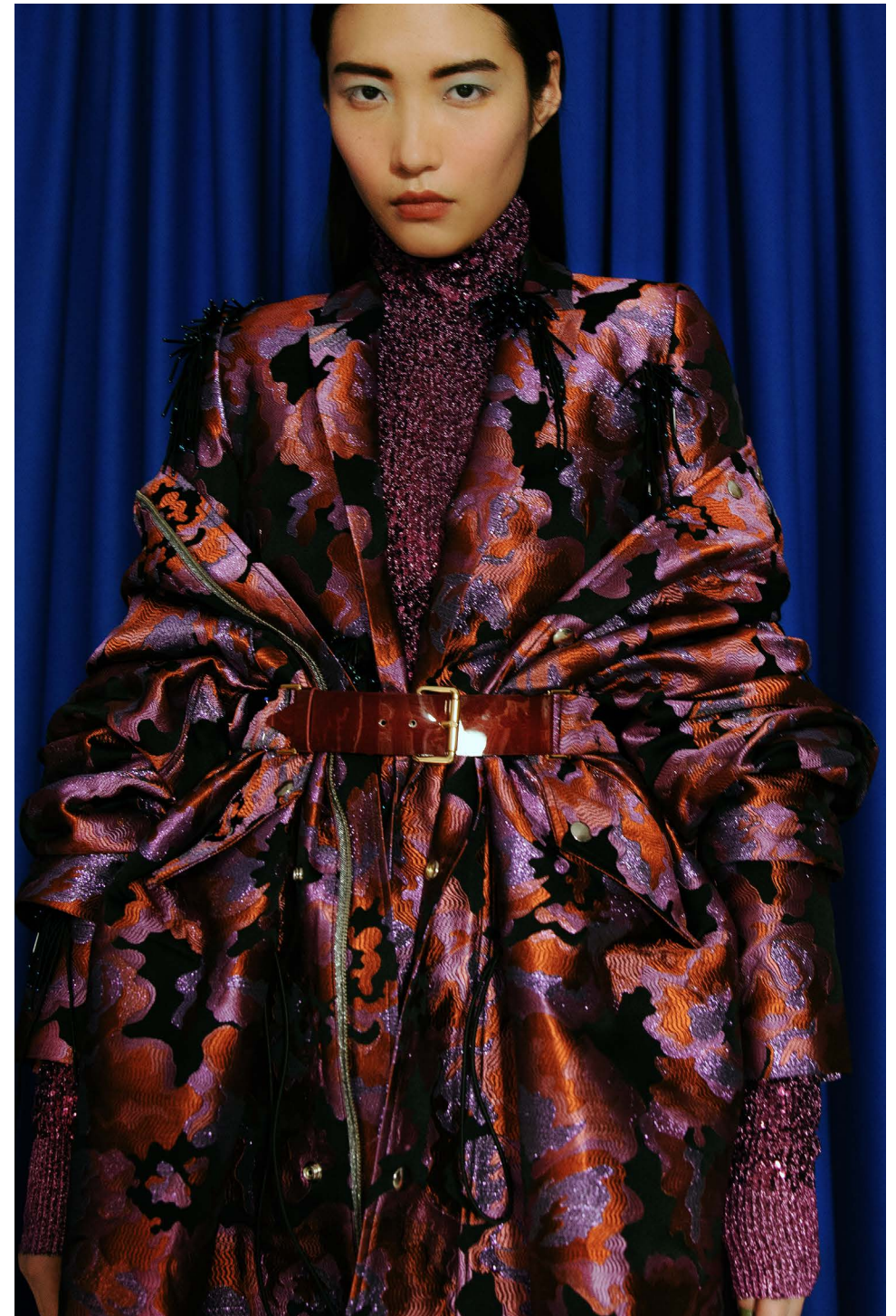
Florals are often a symbol of beauty and change as they keep reinventing themselves in the accordances with the changing seasons.