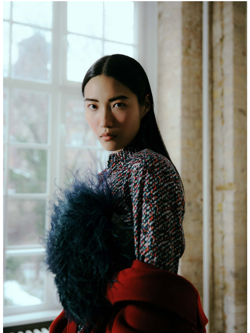
Modern Silhouettes elevating it out of its vintage roots.