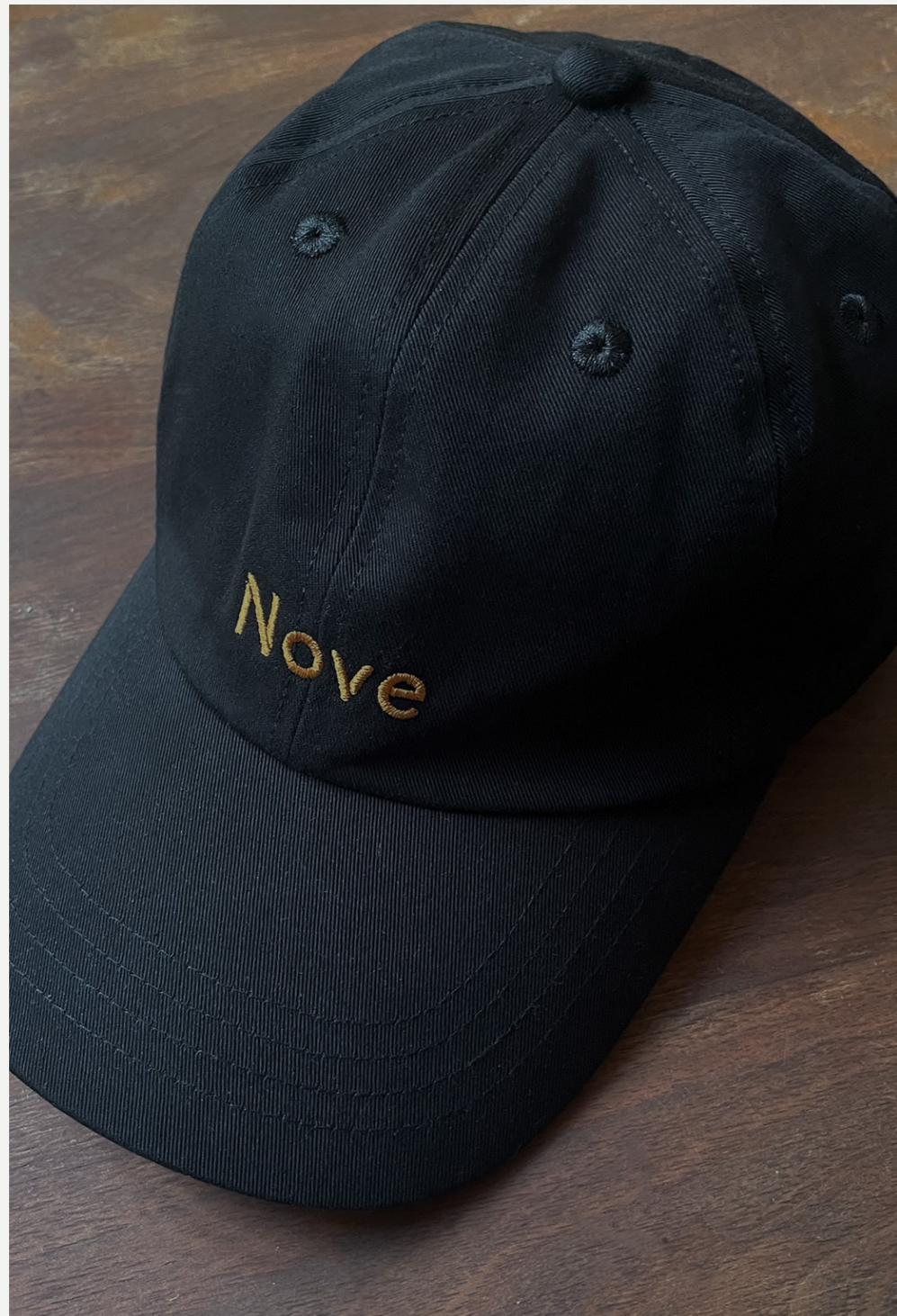
Organic Cotton Cap Launching soon