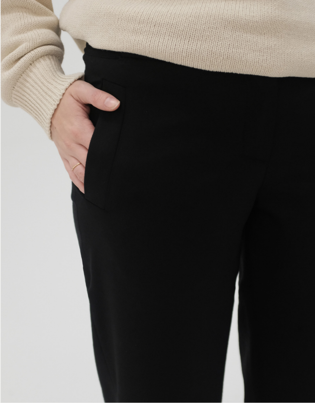
Kasan Trousers Black Fine Wool