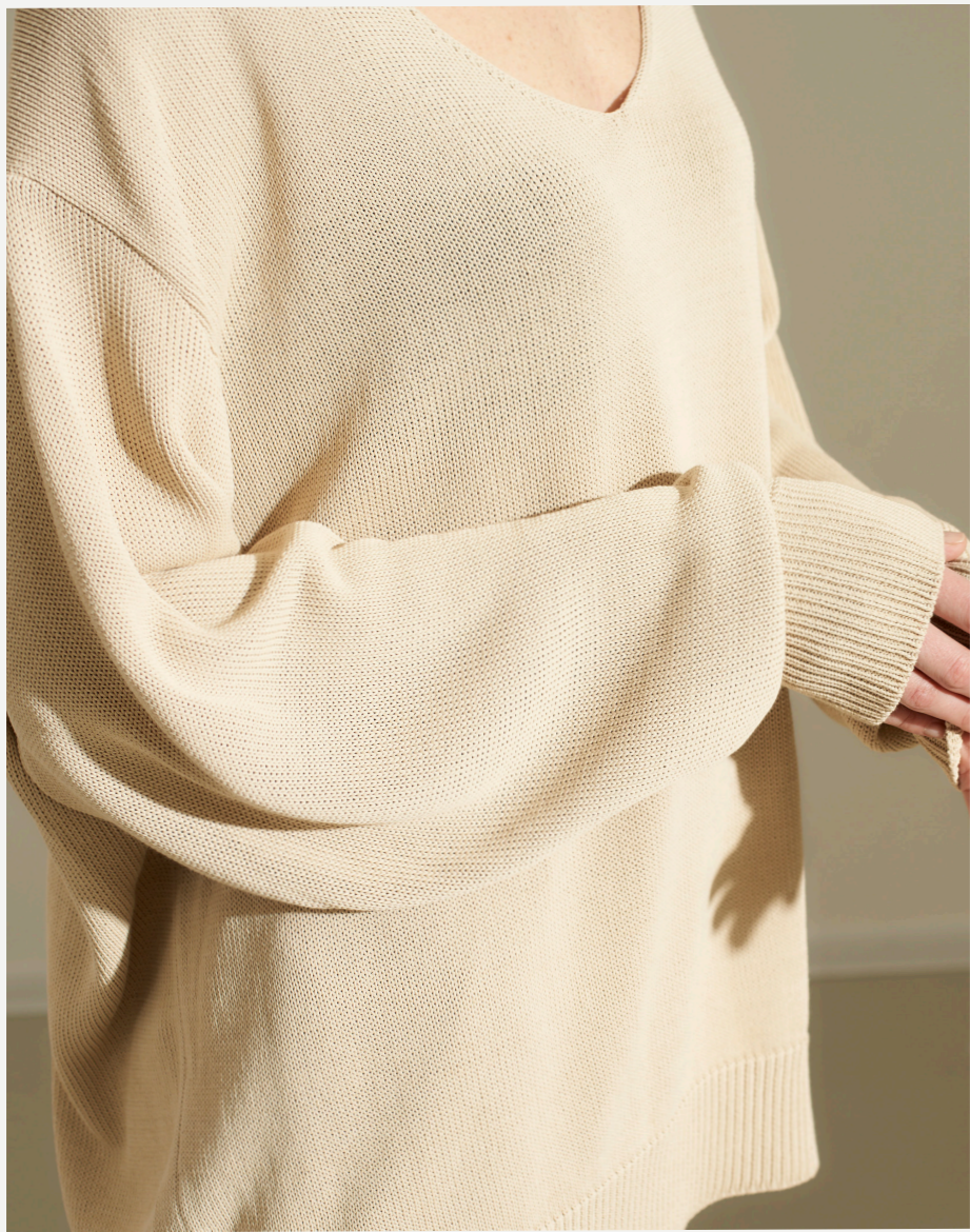
Iya Fine Knit with extra Neck