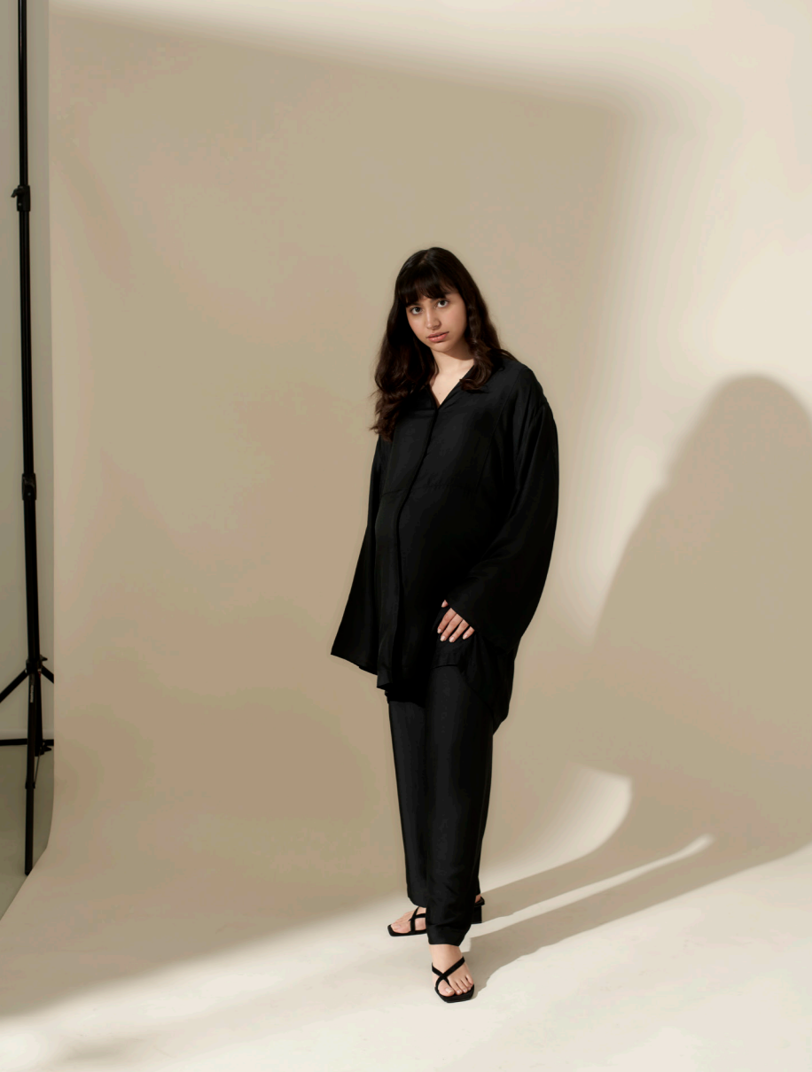
Zéna Two Piece Black