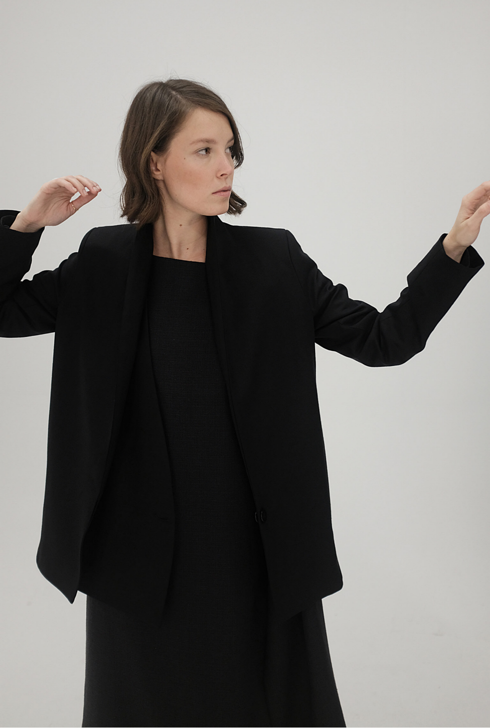
Ane Blazer Black Fine Wool