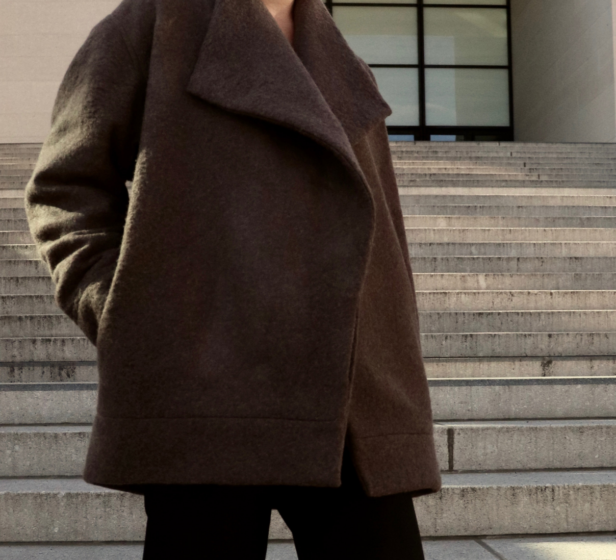
Majka Jacket Light Brown