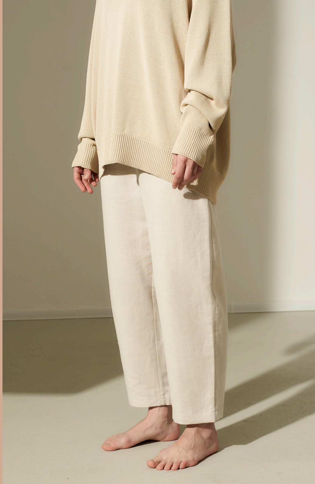
Nény Linen Trousers