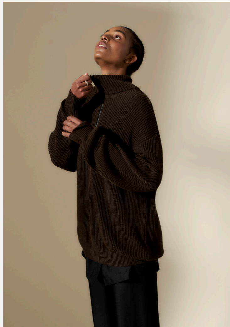
Iya Rib Knit with long Zipper