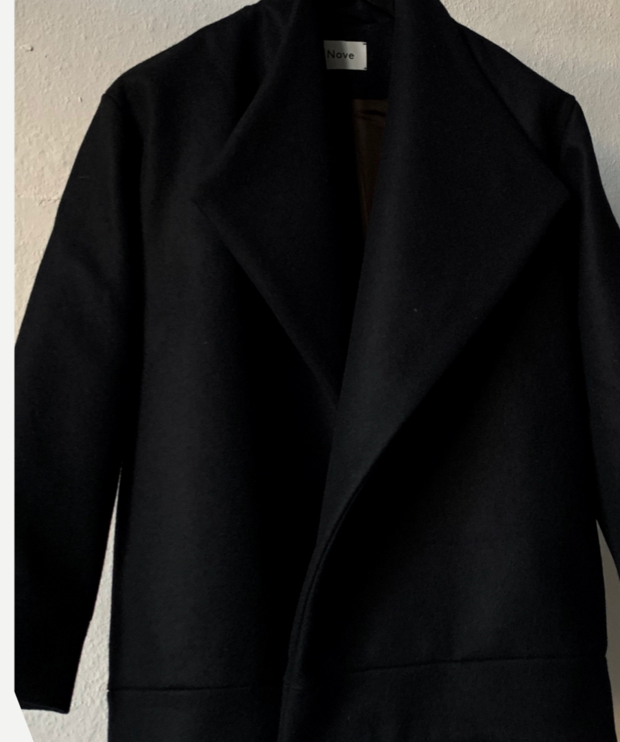
Majka Jacket Black